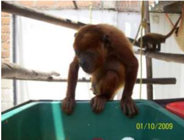
Camila arrived on August 22th; she looked very thin with bad nutrition and without hair in some areas of her body. She is better now.